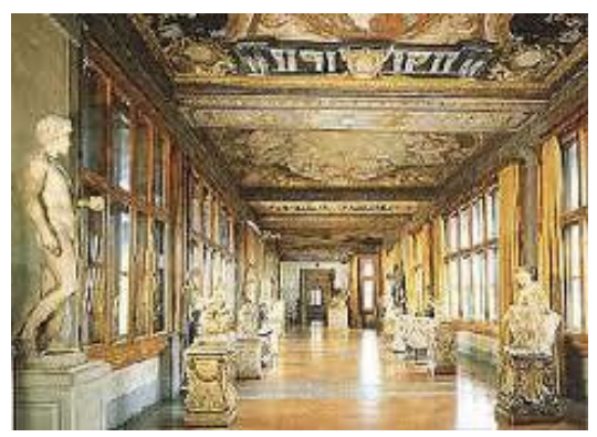
Inside of Uffizi Gallery