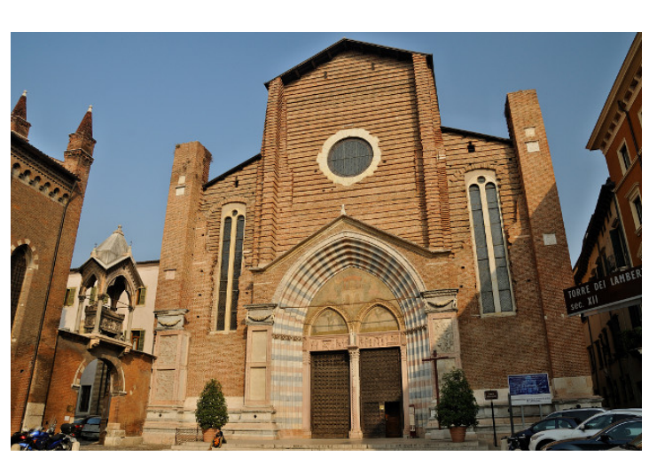
Sant' Anastasia in Verona

MidAm International, Inc. • 39 Broadway, Suite 3600 (36<sup>th</sup> FL) • New York, NY 10006 Tel. (212) 239-0205 • Fax (212) 563-5587 • www.midamerica-music.com