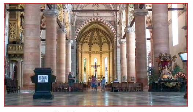
Sant' Anastasia in Verona

Openings for four distinguished guest conductors and their 60-voice choirs to perform a major oratorio with Orchestra da Camera Fiorentina in the Basilica di Santa Croce in Firenze.