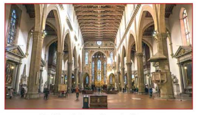
Basilica di Santa Croce in Firenze