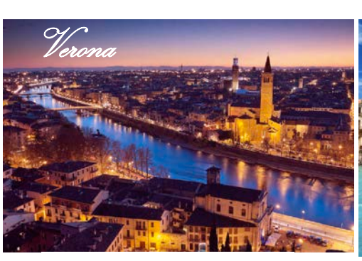
1 day in Verona (2 nights' lodging)