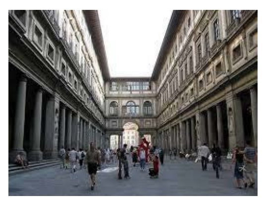
Uffizi from outside