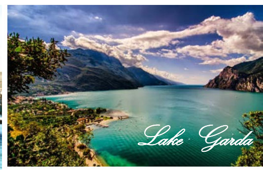
1 full day Lake Garda touring