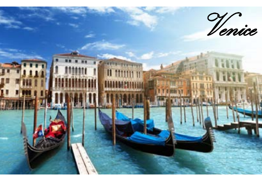
1 full day Venice touring