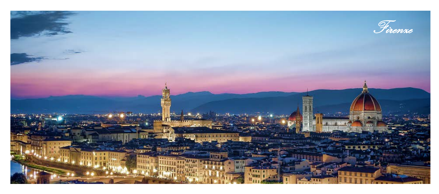
7 days/6 nights in Florence (Firenze)

Open to all choruses in North & South America, Europe, and Asia