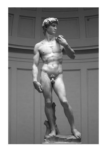
Michelangelo's David @ Academy of Fine Arts